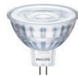
LED 4.6 - 35W MR16 WW 60D D RF 1PF/12 9290024941

This document is for information purposes and must be treated as recommendation. Signify attempted to provide best results, results are generated in lab conditions and might contain faults