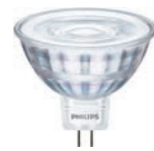
MAS LEDspotLV DimTone 5.8-35W MR16 36D 9290024931

This document is for information purposes and must be treated as recommendation. Signify attempted to provide best results, results are generated in lab conditions and might contain faults