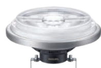
Master LEDspot Expertcolor 15-75W 9290022390