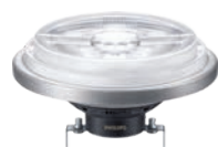
Master LEDspot Expertcolor 11-50W AR111 9290022388

This document is for information purposes and must be treated as recommendation. Signify attempted to provide best results, results are generated in lab conditions and might contain faults